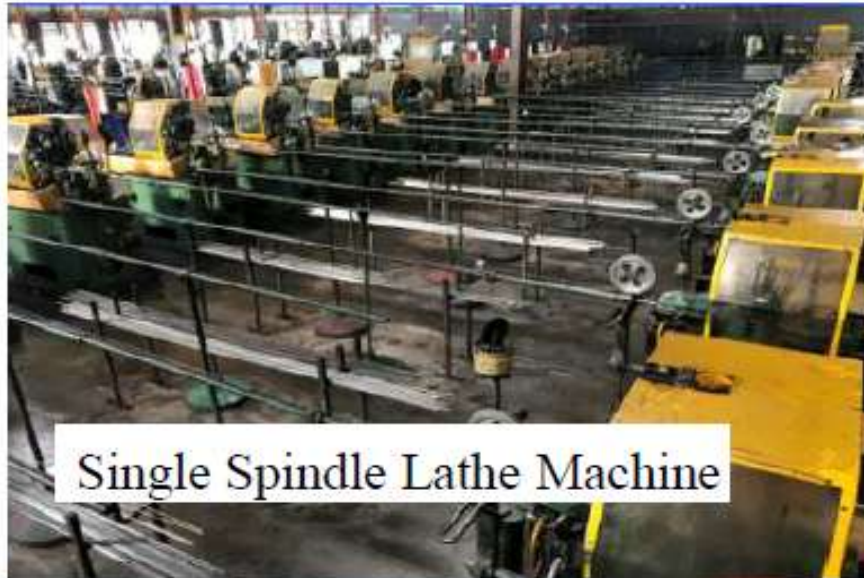
Single Spindle Lathe Machine