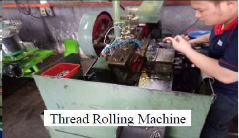
Thread Rolling Machine