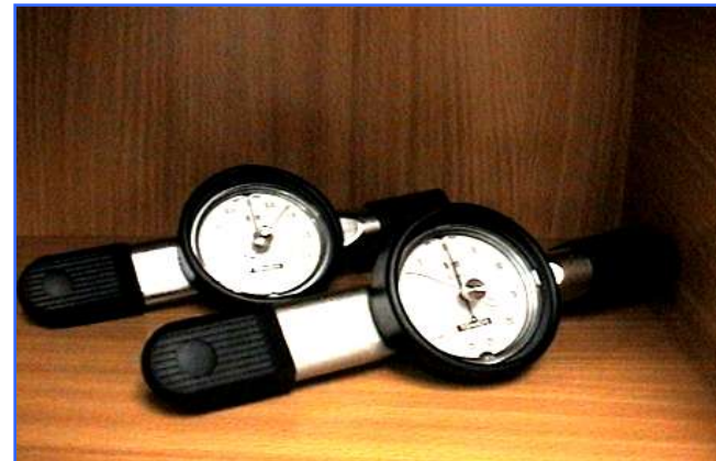
Push Out Tester