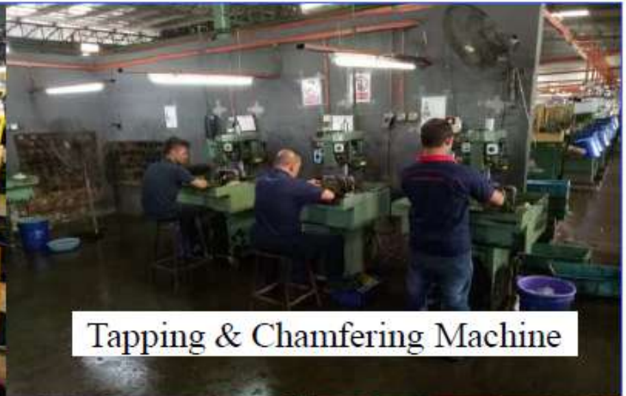
Tapping & Chamfering Machine