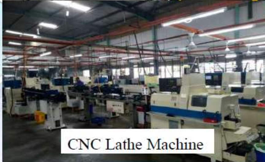
CNC Lathe Machine