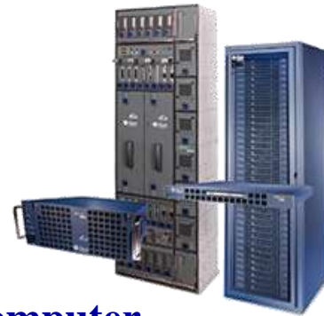
Computer Servers/Networking products