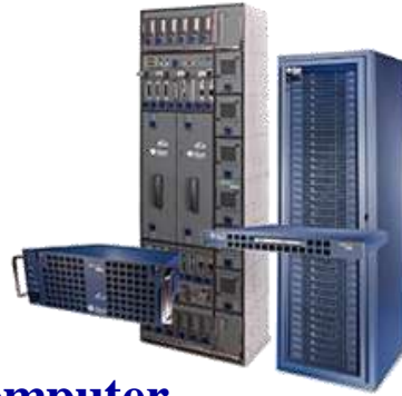
Computer Servers/Networking products