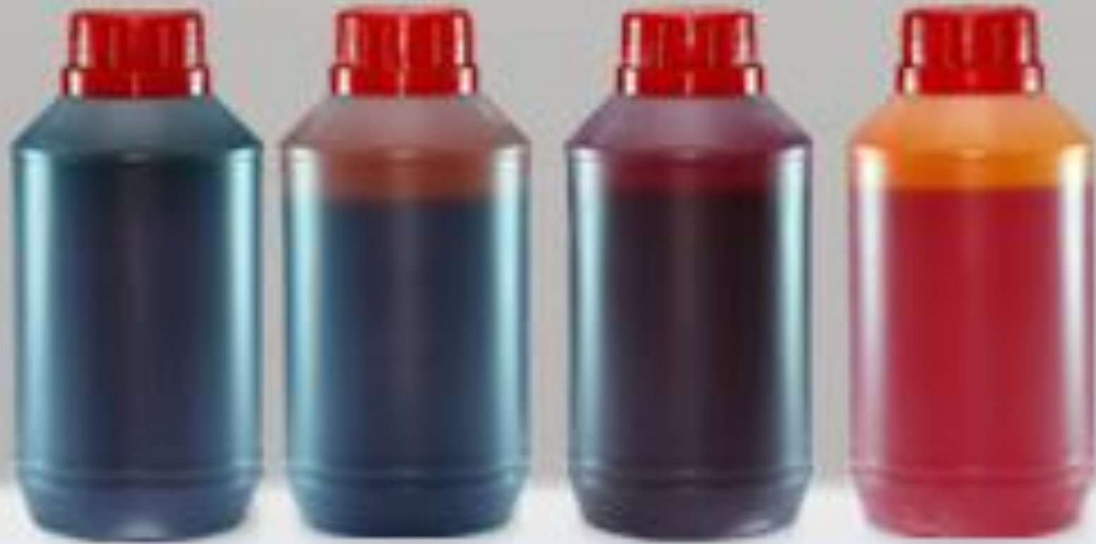
Color Dye and Premix Epoxy